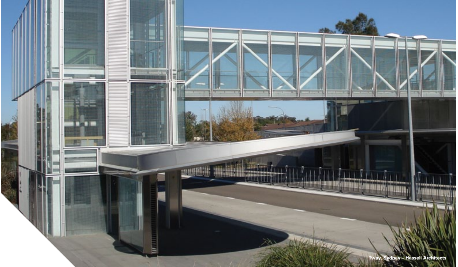
Tway, Sydney – Hassell Architects