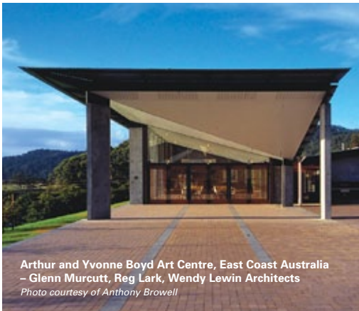
Arthur and Yvonne Boyd Art Centre, East Coast Australia – Glenn Murcutt, Reg Lark, Wendy Lewin Architects